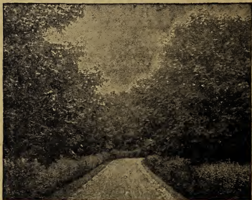
A Driveway Bordered With California Privet

BARBERRY, Japanese —Fine for hedging. Needs no trimming. Full of red berries all winter.